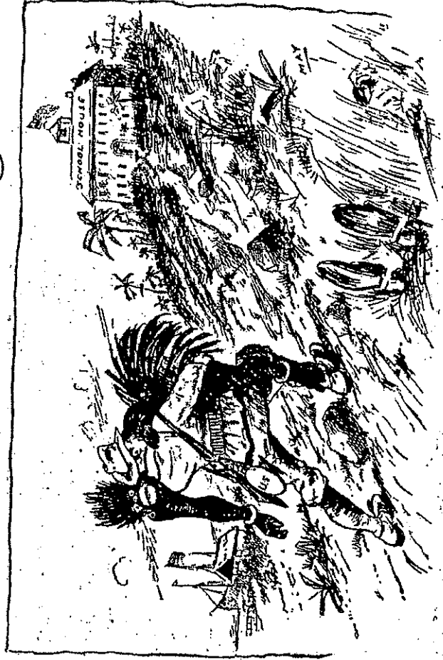
THE WHITE MAN'S BURDEN.— The Journal, Detroit.