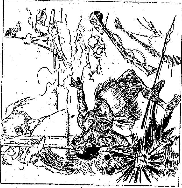
SAVED FROM THE CRUEL SPANIARD.