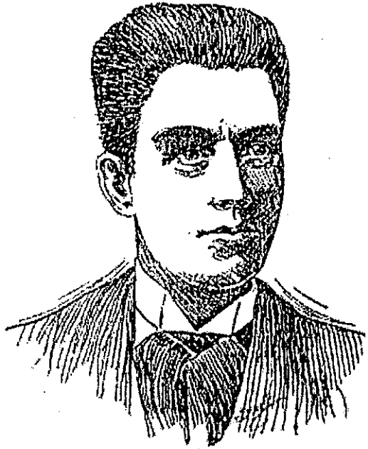
GEN EMILIO AGUIBALDO