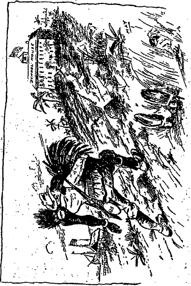
SAVED FROM THE CRUEL SPANIARD. —The Chronicle, Chicago.